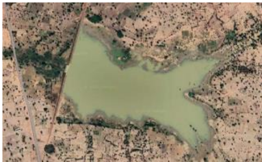
Rainwater retention Basin from the dry phase Feb. 22

The time is ripe, the master's thesis with the first retention basin in Basqudre has been completed, and the goal must now be to build around 72 rainwater retention basins in Burkina Faso by 2030, which will allow many millions of people direct and indirect access to fresh water. Above all, these people will find prospects for a decent life on the ground, which could, among other things, stem the flow of economic refugees to Europe from these regions.